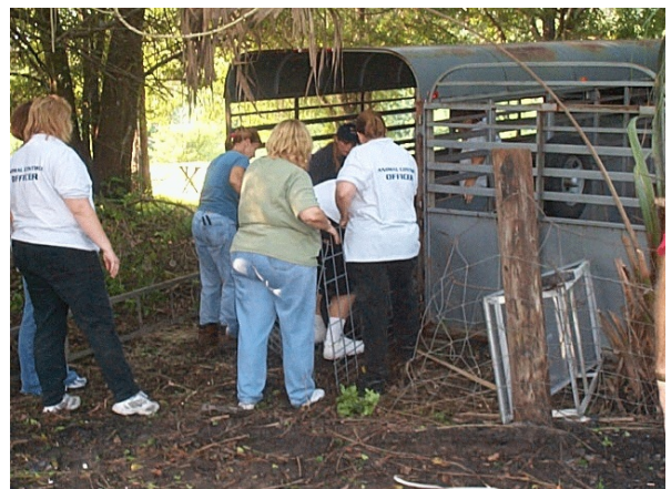
Lee County Animal Services working along side rescue volunteers to load and transport six pigs abandoned in N. Fort Myers, Florida in 2001